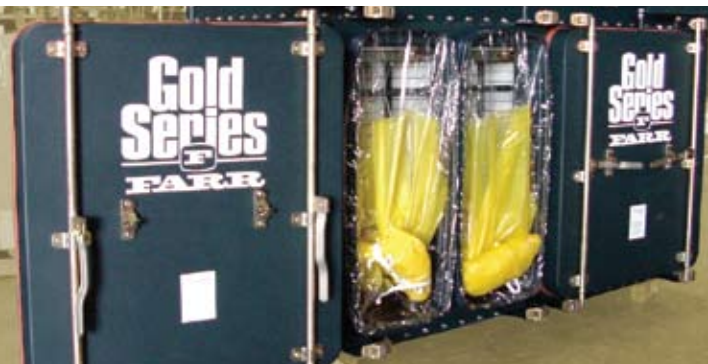
GS8 Containment Dust Collector Filter Change-out