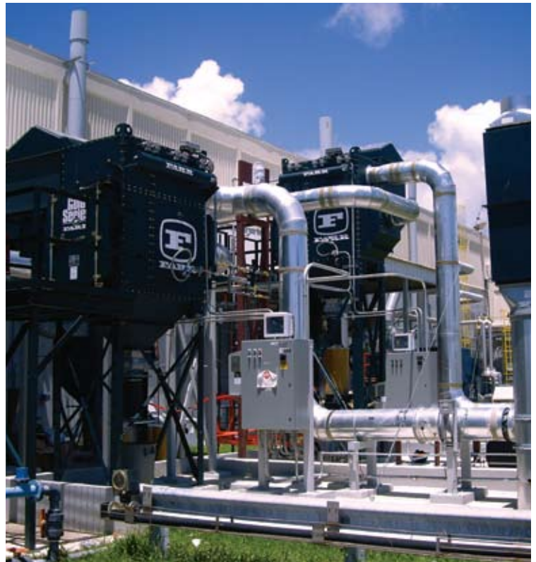
Two Gold Series Camtain CGS6 models on a pharmaceutical application in Guayama, P.R