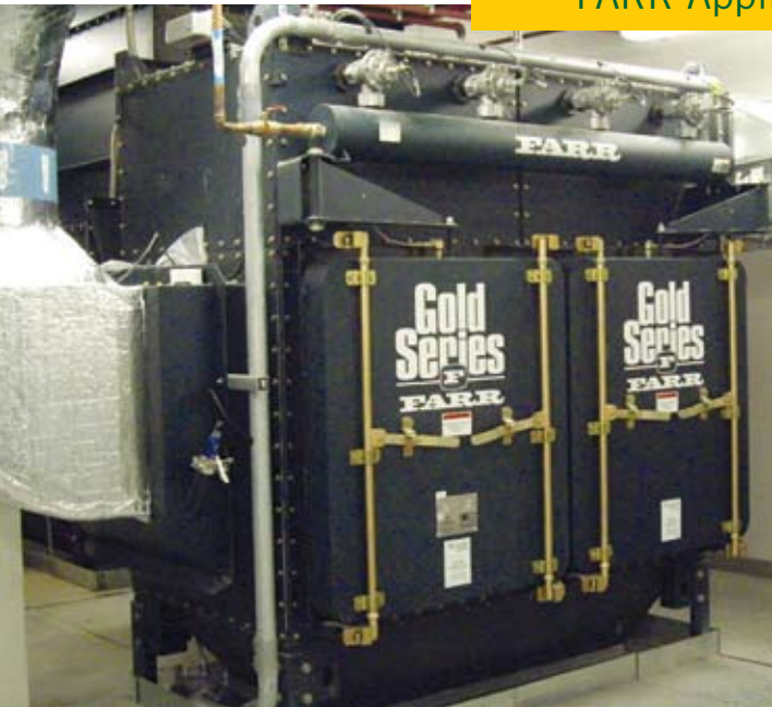
GS8 Camtain™ on Potent Compounds from Tablet Coating